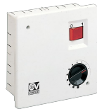
SCNRB SCAT.COM.NON REV.INCASSO Code 12971