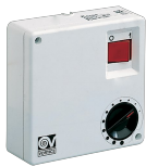
C 1.5 (COMANDO EL. 1.5 A) Code 12966