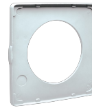
S 100/4 Code 22154