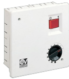
SCNRB SCAT.COM.NON REV.INCASSO Code 12971