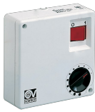
C 1.5 (COMANDO EL. 1.5 A) Code 12966