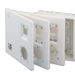
KIT SCB (TRASF.E.C.) Code 22481